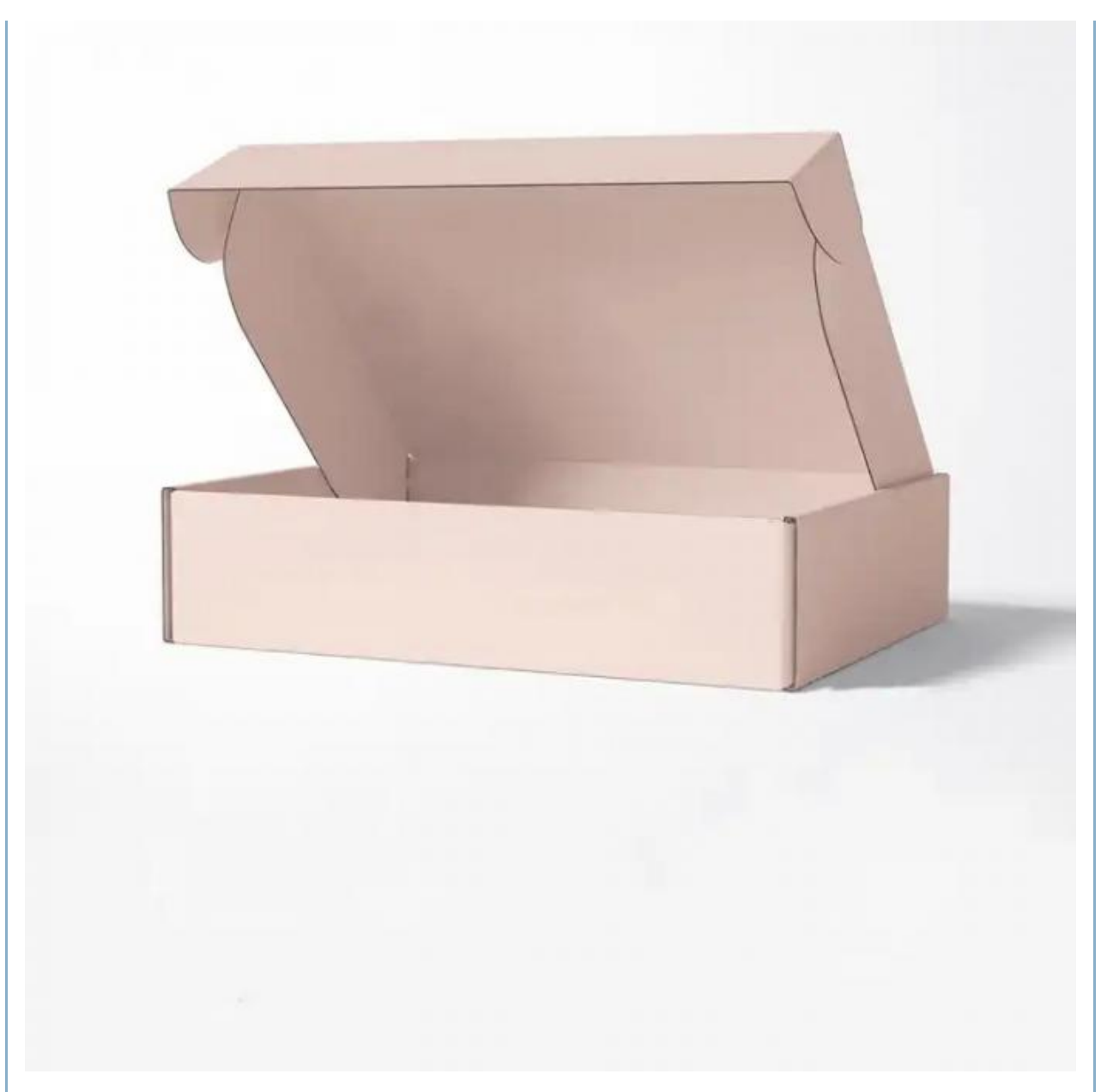
Packing & Delivery