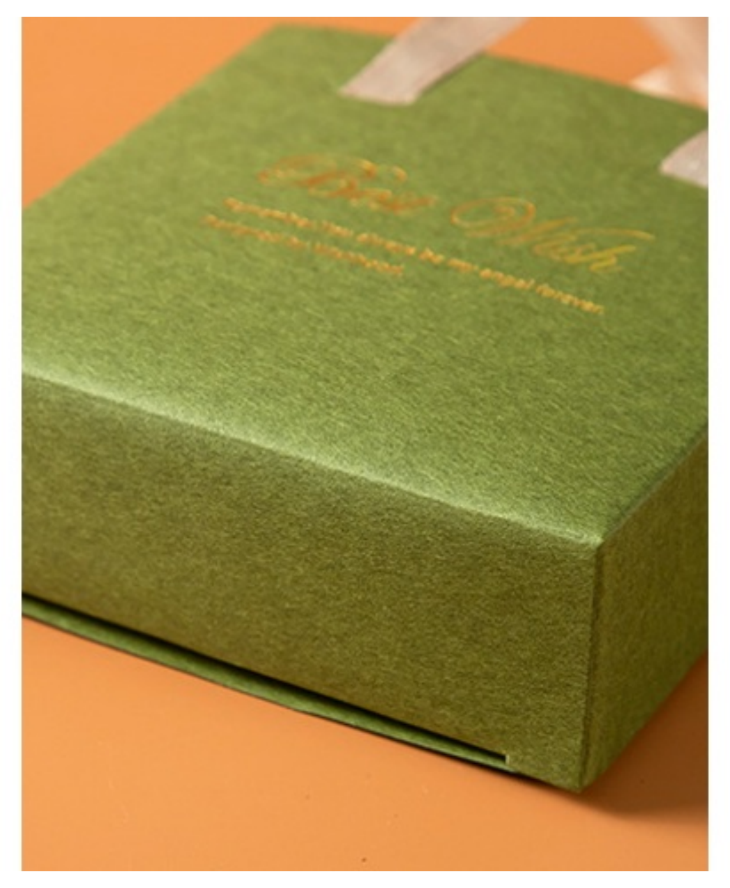
Style / Size / Color