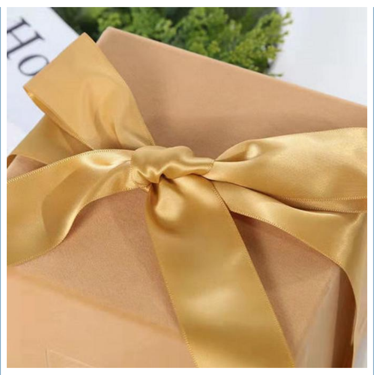
Style / Size / Color