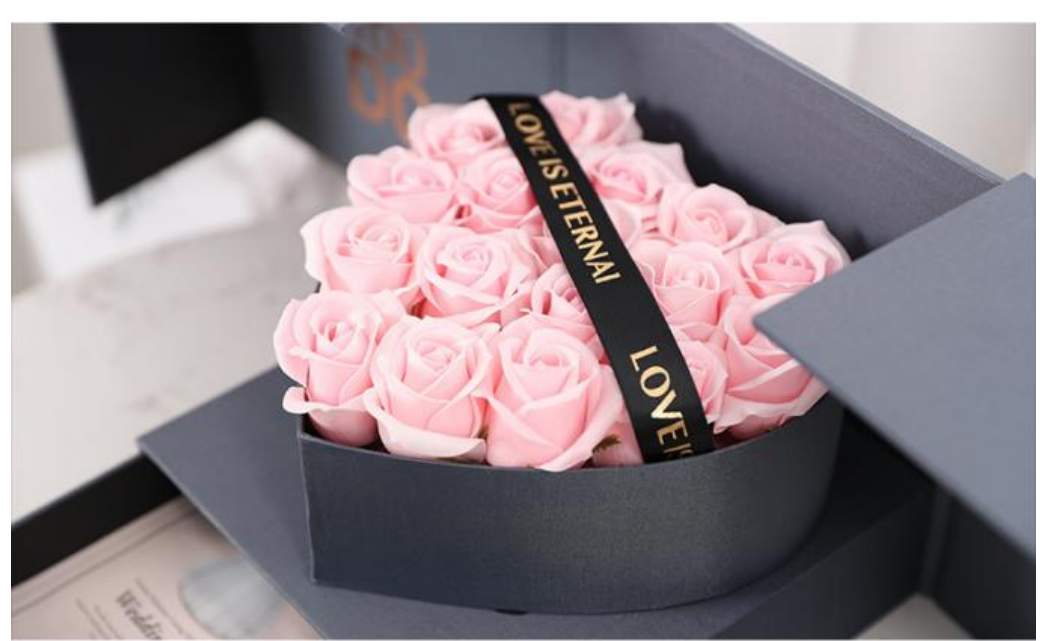
THE REASON WHY THE WORLD IS SO BEAUTIFUL IN MY EYES IS BECAUSE OF LOVE. I HOPE YOU AND I WILL NOT FORGET THE BRAVE PURSUIT, A BEAUTIFUL GIFT TO RELIVE THE LOVE TO BLOOM