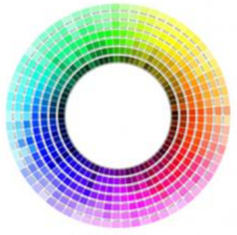
Be used for the printing of varied colors!