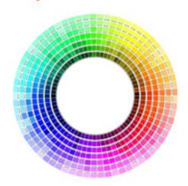
Be used for the printing of varied colors!