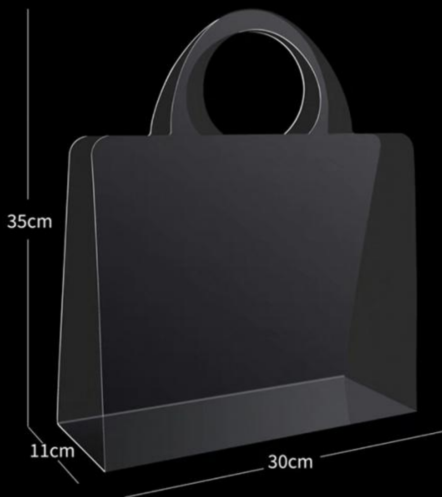
鲜花透明手提袋——A款 尺寸：35*11*30cm 材质：PET 数量：1个/包