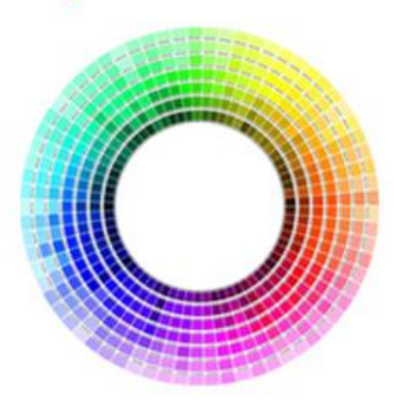
Be used for the printing of varied colors!