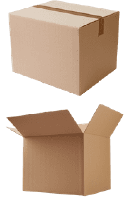
Wholesale Simple Style Custom Design Paper Boxes Gift Packaging Boxes For Egg