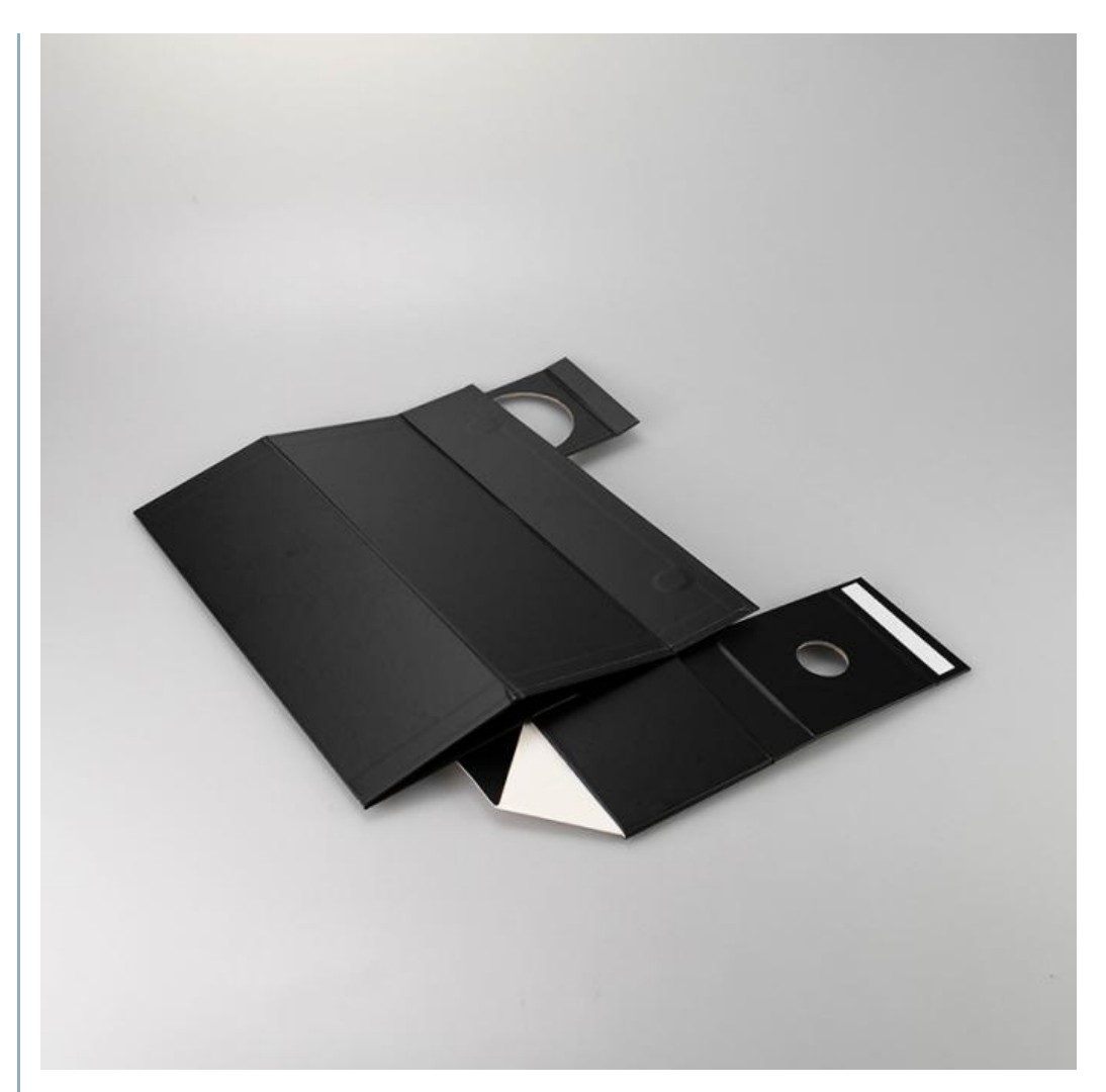
Style / Size / Color