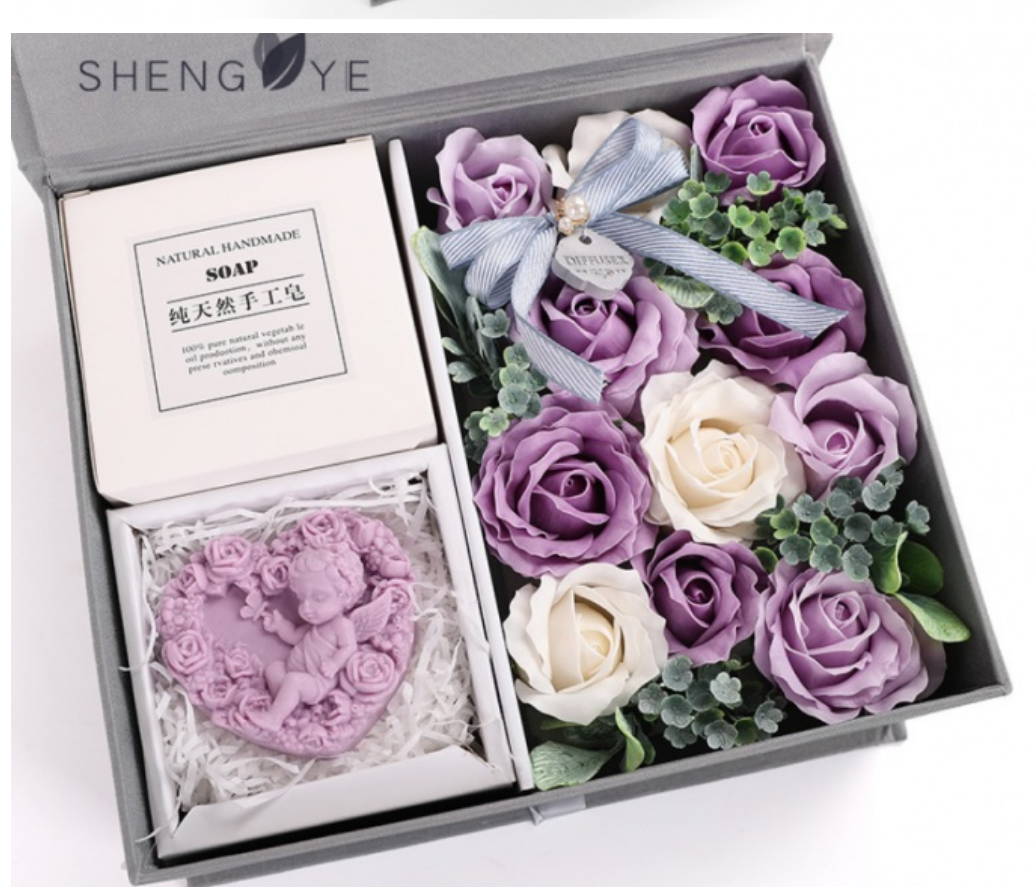
Packing & Delivery