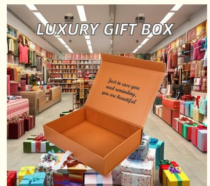
Unique Design Magnet Seal Eco-Friendly